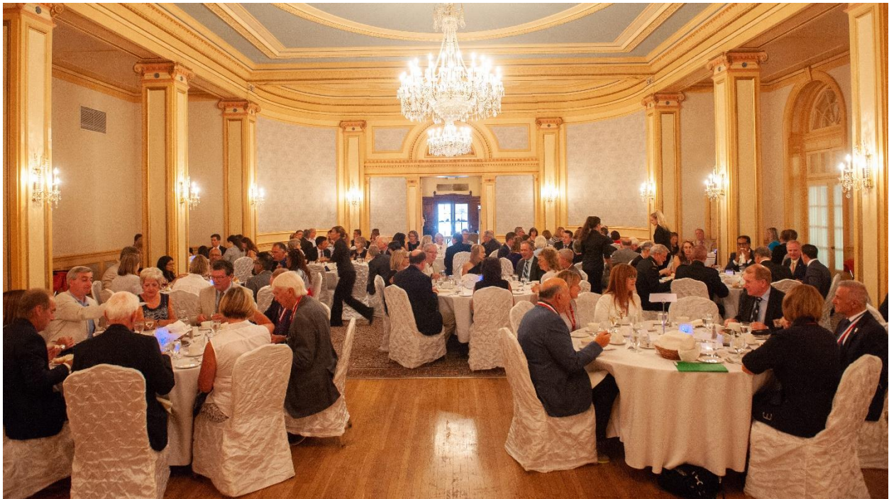
Georgian Ballroom & Terrace